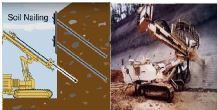
Fig2.2: Drilling holes