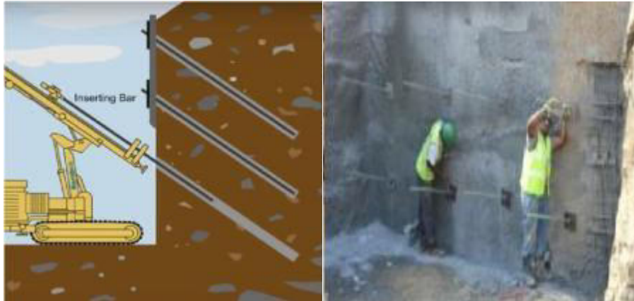
Fig 2.3: Nail inserting and grouting