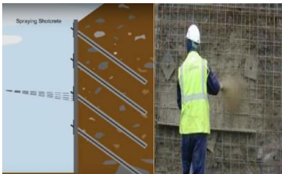
Fig 2.5: Spraying shotcrete