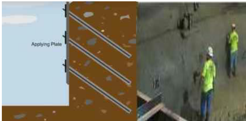
Fig 2.4: Applying plates